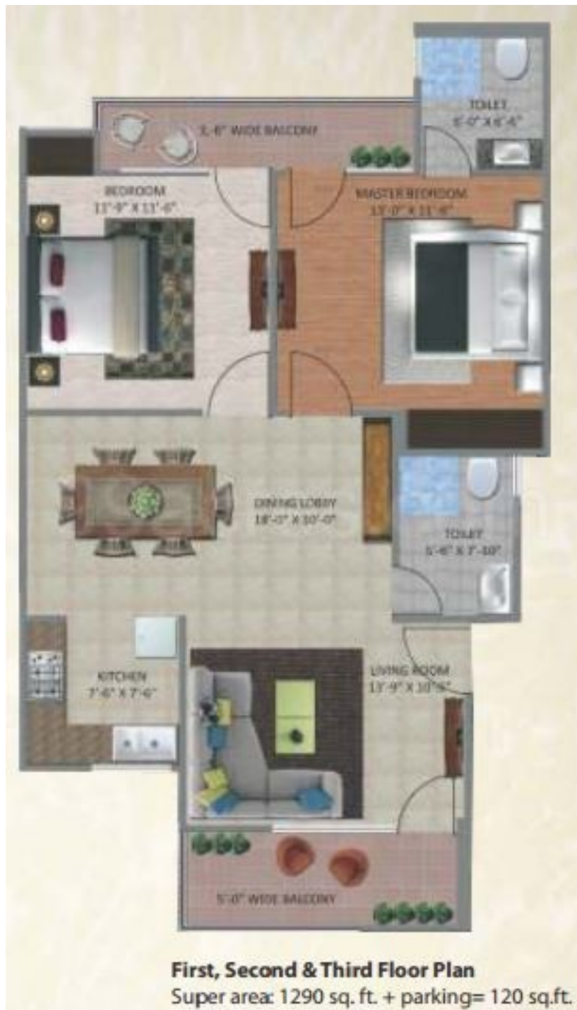
First, Second & Third Floor Plan Super area: 1290 sq. ft. + parking= 120 sq.ft.